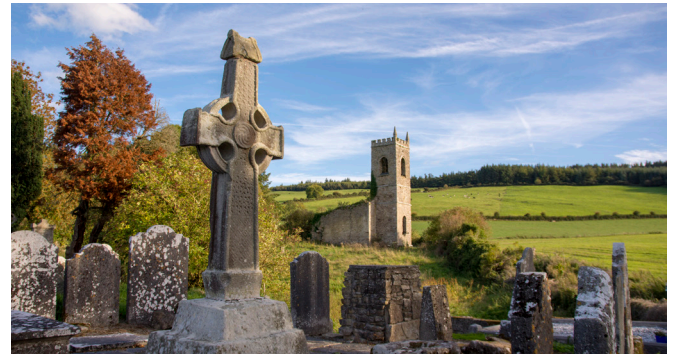
Kilamery High Cross.

The Lamogue Ogham Stones, dated between 400-900 AD, can be discovered in a graveyard which is enclosed by a very fine stone wall and sits in the middle of a large field.