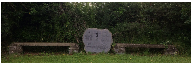
Callan Famine Graveyard

This route brings you past the ancient Kells Priory on the banks of the King's River, one Ireland's largest and most impressive medieval settlements with its stunning series of tower houses. You can also visit Callan's Cherryfield Famine Graveyard, named for the many cherry trees that blossom so beautifully and poignantly over this final resting place for the hundreds of inmates of the nearby Callan workhouse who died during the Great Hunger.